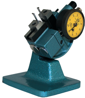
Gage shown is DYS with special metric indicator, part# 2305 arms, and part # 18967 bench stand