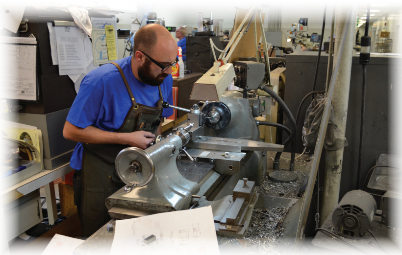
Dorsey Products - proudly made in the USA